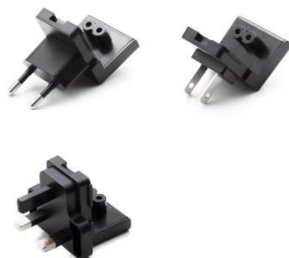
Option: country adapter EU, US, UK