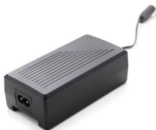
Switch mode power supply, SM43