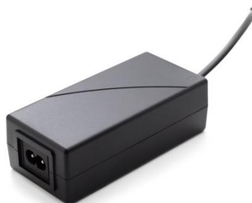
Switch mode power supply, SM42