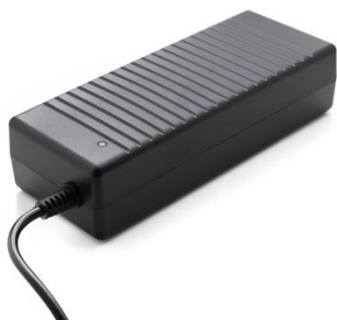
Switch mode power supply, SM31