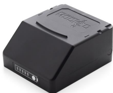
Lithium Ion Accu Pack; Serie: SC701