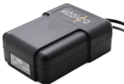
Lithium Ion Accu Pack; LLPS7S1P