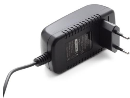
Lilo-Charger 7S; Model LCH 735