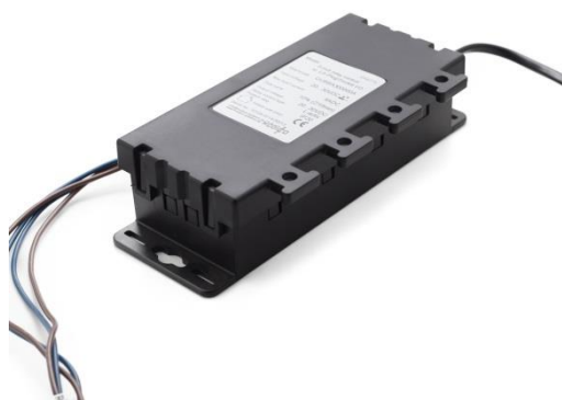
LCR 2-mot Relais Box