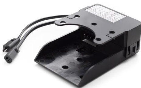
Lithium Ion Accu Pack; Serie: SC701