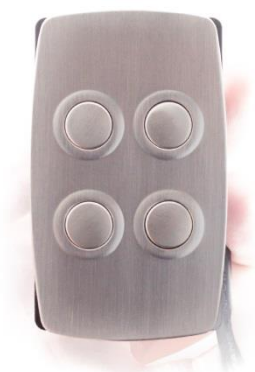
2-mot insert Switch_Metal_V2