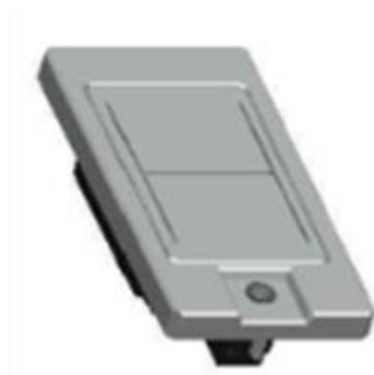
1-mot insert Switch_Metal_V1