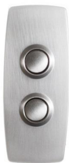
1-mot insert Switch_Metal_V1.1